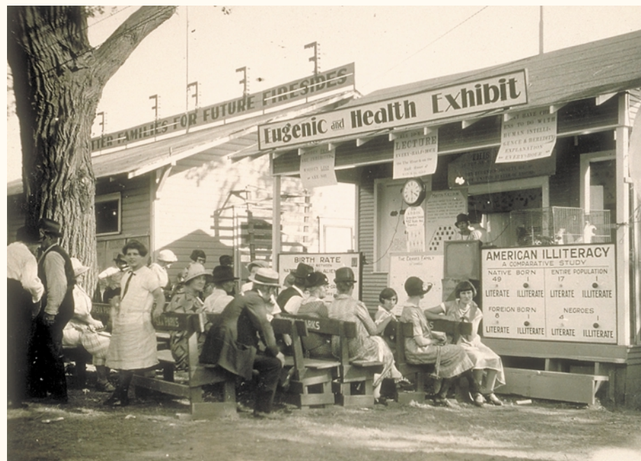
Figure 3 | Eugenics Pavilion at Texas State Free Fair, 1920. During the 1920s, the American Eugenics Society used state fairs as venues for popular education. The placard on top of the building to the left announces 'Fitter Families for Future Firesides', a contest that judged the eugenic fitness of competing families.

Many Americans believed they had reason to resent the influx of new immigrants. Labour organizations fanned fears that native workers would be displaced from their jobs by an oversupply of cheap immigrant labour. Anti-Communist factions predicted a 'red