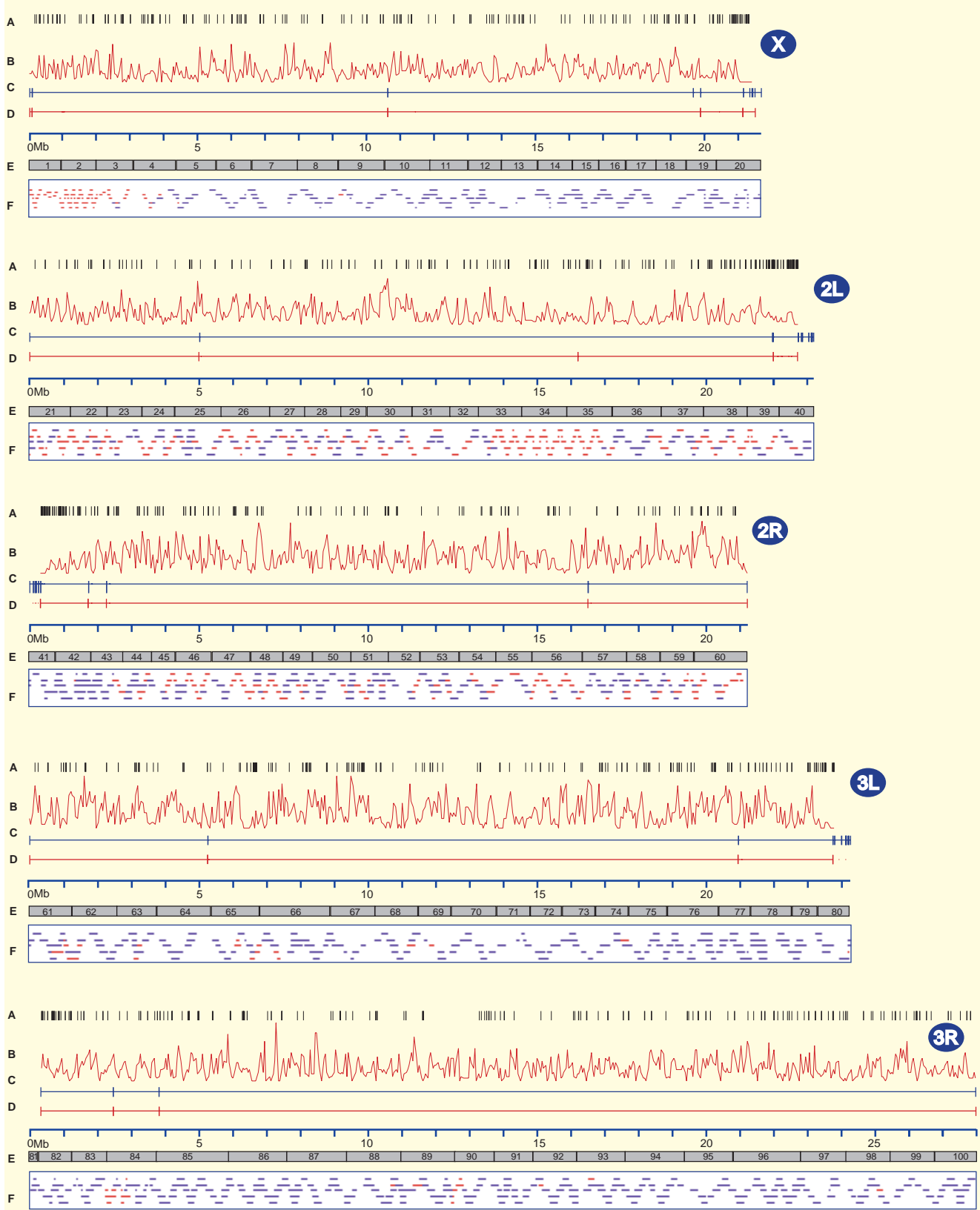
Fig. 3. Assembly status of the Drosophila genome. Each chromosome arm is depicted with information on content and assembly status: (A) transposable elements, (B) gene density, (C) scaffolds from the joint assembly, (D) scaffolds from the WGS-only assembly, (E) polytene chromosome divisions, and (F) clone-based tiling path. Gene density is plotted in 50-kb windows; the scale is from 0 to 30 genes per 50 kb. Gaps between scaffolds are

represented by vertical bars in (C) and (D). Clones colored red in the tiling path have been completely sequenced; clones colored blue have been draft-sequenced. Gaps shown in the tiling path do not necessarily mean that a clone does not exist at that position, only that it has not been sequenced. Each chromosome arm is oriented left to right, such that the centromere is located at the right side of X, 2L, and 3L and the left side of 2R and 3R.